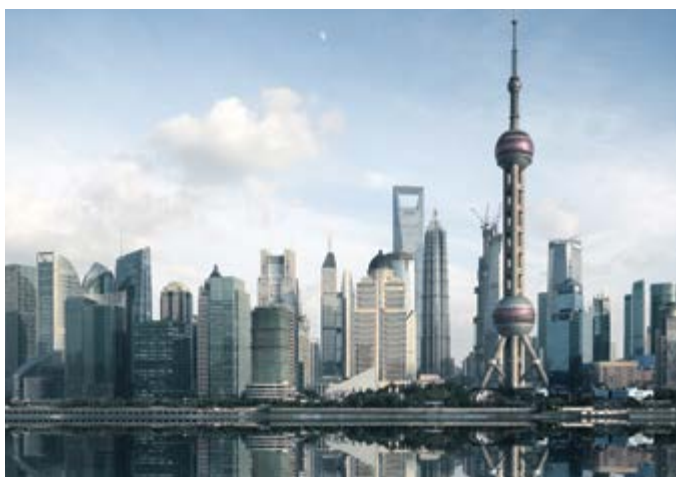
Doing Business in China: Shanghai, China, October 24 - November 4, 2016