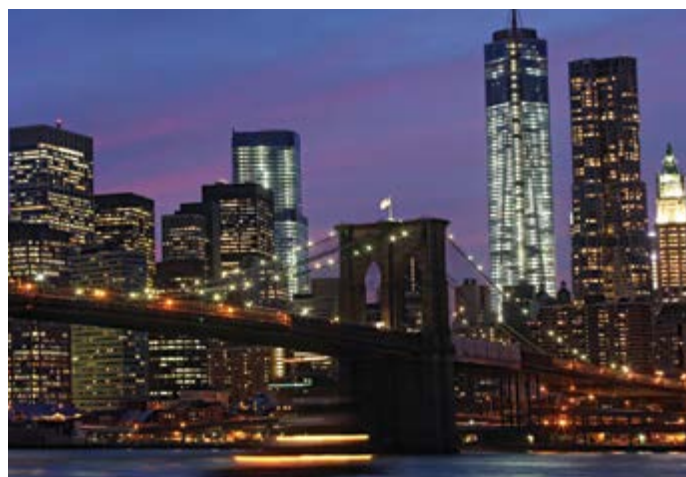
Executive Decision Making (DBA/PhD) and International Business Management (MBA/IEMBA): New York City, USA July 11-22, 2016