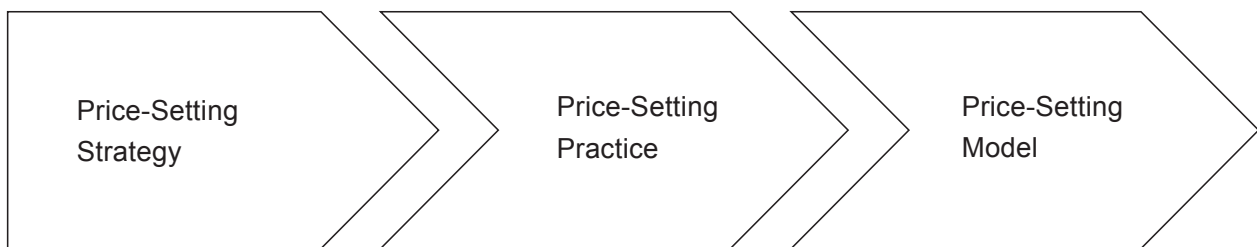
Figure 2 | Pricing Decision Process

The main finding of research question 1 is that all case study firms have implemented price-setting strategies, which are based on suitable price-setting practices to collect data and to prepare pricing decisions. The selection of the price-setting models is based on the price-setting strategy and practice. The answers to research question 2 identify the reasons why and how price-setting strategies, practices and models differ.